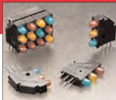
3mm PC Board Mount LEDs